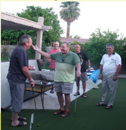
Gabriola Southern Open "Putting Practice"

"I'll have you know I've been standing on your ball for the last five minutes!" ■