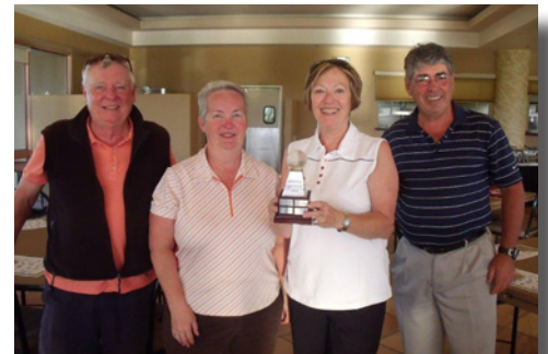
The winning team from the Gabriola Southern Open